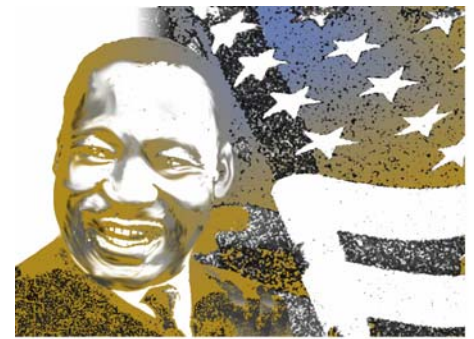
Martin Luther King Jr. Day